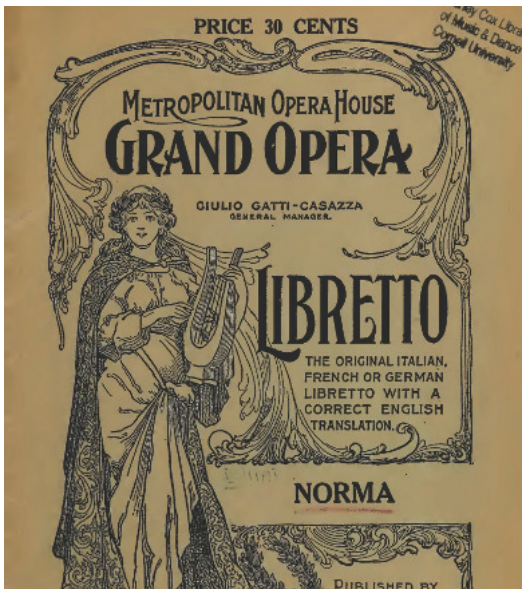
Libretto to the opera Norma by Vincenzo Bellini and Felice Romani 由貝里尼(Vincenzo Bellini, 1801-1835)與羅馬尼(Felice Romani, 1788-1865)所創作的歌劇《諾瑪》劇本 (US-I ML50.B44 N8 1900)